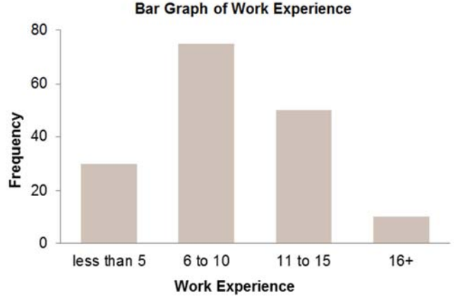
Figure 1. Work Distribution.

According to Table 2, 58.9% respondents were males and 41.1% were females. This indicates lack of gender parity amongst respondents. Concerning the age of respondents, Table 2 shows that 36.9% of the respondents were aged 31-40 years, 32.7% were 21-30 years old, 19.6% were less than 20 years old and the minority group was 41-50 years with 7.1%. The distribution of age shows that most of the respondents were aged 31-40 years. The work experience is represented in the bar graph of figure 1.